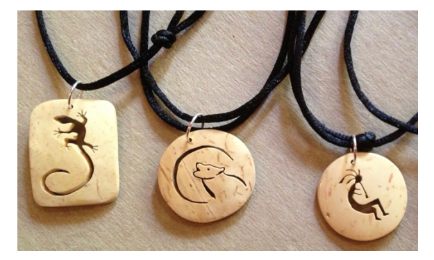
Coco Spirit by Rafael – Hand-carved coconut shell necklaces with adjustable cords as well as earrings.

Women of Panabaj is a group of 25 women formed in response to the landslide after Hurricane Stan in 2005. The women work on small foot looms and make belts, camera straps, wallets, and more.